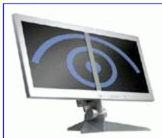
Twin panel technology

DoubleSight is a uniquely designed dual LCD monitor that employs two 15-inch flat panels mounted side-by-side on a single base to provide 24 by 9 inches of screen real-estate despite a relatively small desktop footprint. Using a single controlling motherboard to manage the displays, the DoubleSight DS-1500 is capable of stretching single documents like spreadsheets across two monitors, or simultaneously displaying multiple applications to eliminate the hassle of opening and closing different windows.